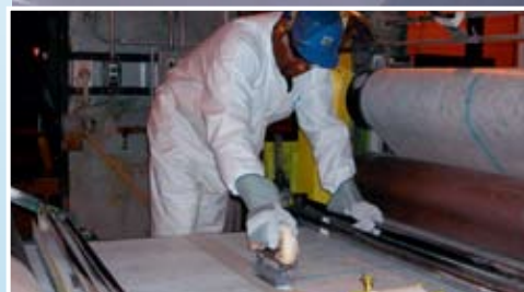
G-476 textile splicing