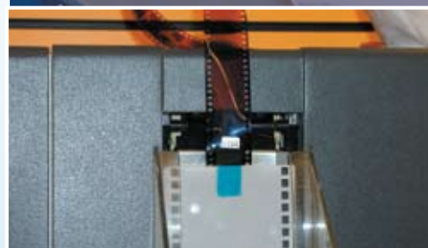
Tape attachment to leader card for one-hour photo processing

Saint-Gobain Performance Plastics CHR® brand splicing and seaming tapes are manufactured from polyester film and offer an economical platform to hold, seam, splice, bond or protect materials. These tapes have exceptionally high tack, resist extreme temperatures and have excellent quick stick and wet-out capabilities.